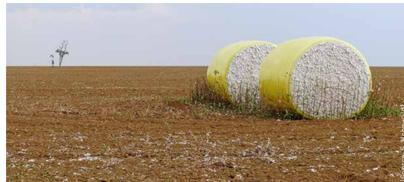
Cotton bales in the cleared agricultural landscape of Central Brazil.