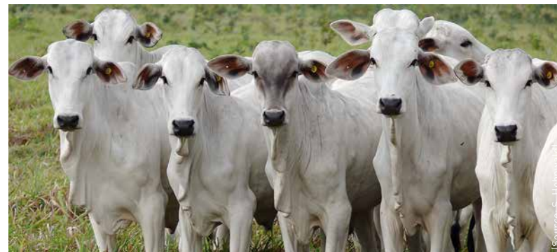
The Nelore breed of cattle is often reared on large farms as it is well adapted to the tropical climate.