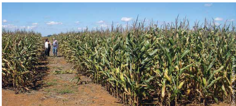
Experiments aimed at increasing soil carbon in a maize field near Campo Verde.

All is going well so far. In an experiment on one farm in Cuiabá, for example, the farmer is working eucalyptus bark, sugar cane molasses and wood chips into the soil of one field and the scientists are analysing how this improves the soil and enriches it with carbon and nitrogen.