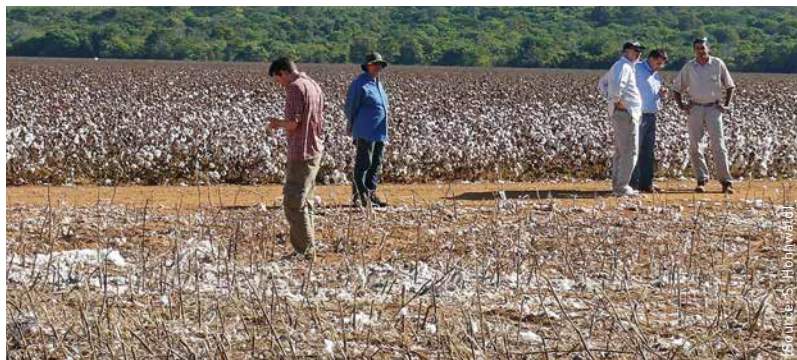
Scientists and farmers discuss the effects of climate change on cotton crops in Mato Grosso.

simulate the consequences of climatic change for crop yields in further sub-projects.