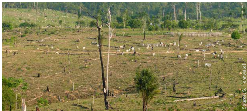
Rainforests in Pará are being felled to make way for pasture.