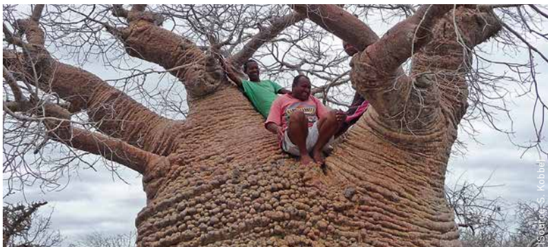
The Baobab tree with its vast water storing trunk is characteristic of Madagascar's dry regions.