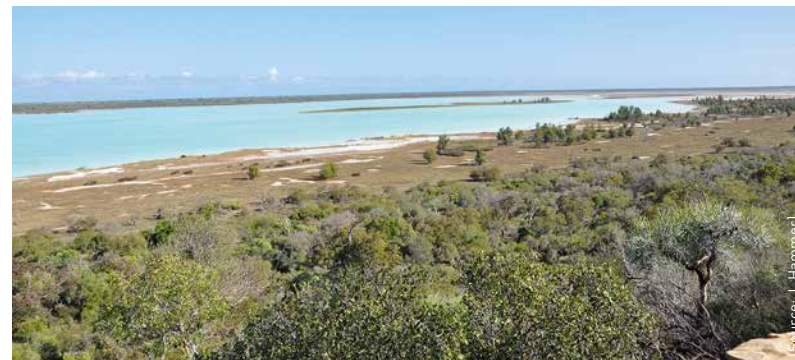
Lake Tsimanampetsotsa is a 15-kilometre long salt lake which gives its name to the national park in the study region.

Forestry scientists, economists, agronomists and social and cultural scientists from Germany and